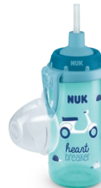
NUK Flexi Cup