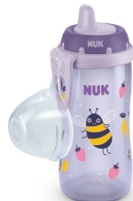
NUK Kiddy Cup