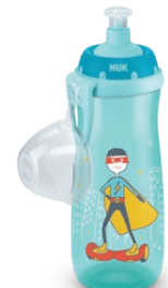
NUK Sports Cup